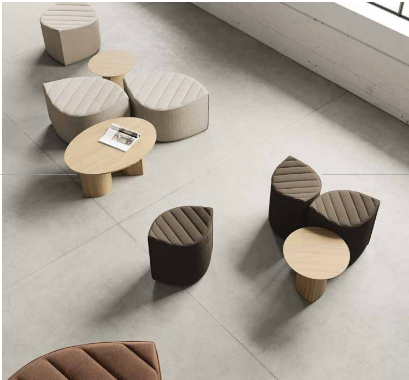
Ostoa Table Central Column